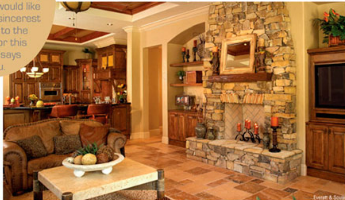
Everett & Soule